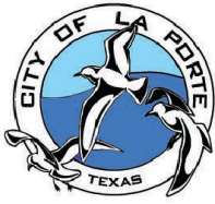
EXHIBIT A - ACKNOWLEDGEMENT

The undersigned agrees this submission becomes the property of the City of La Porte after the official opening.