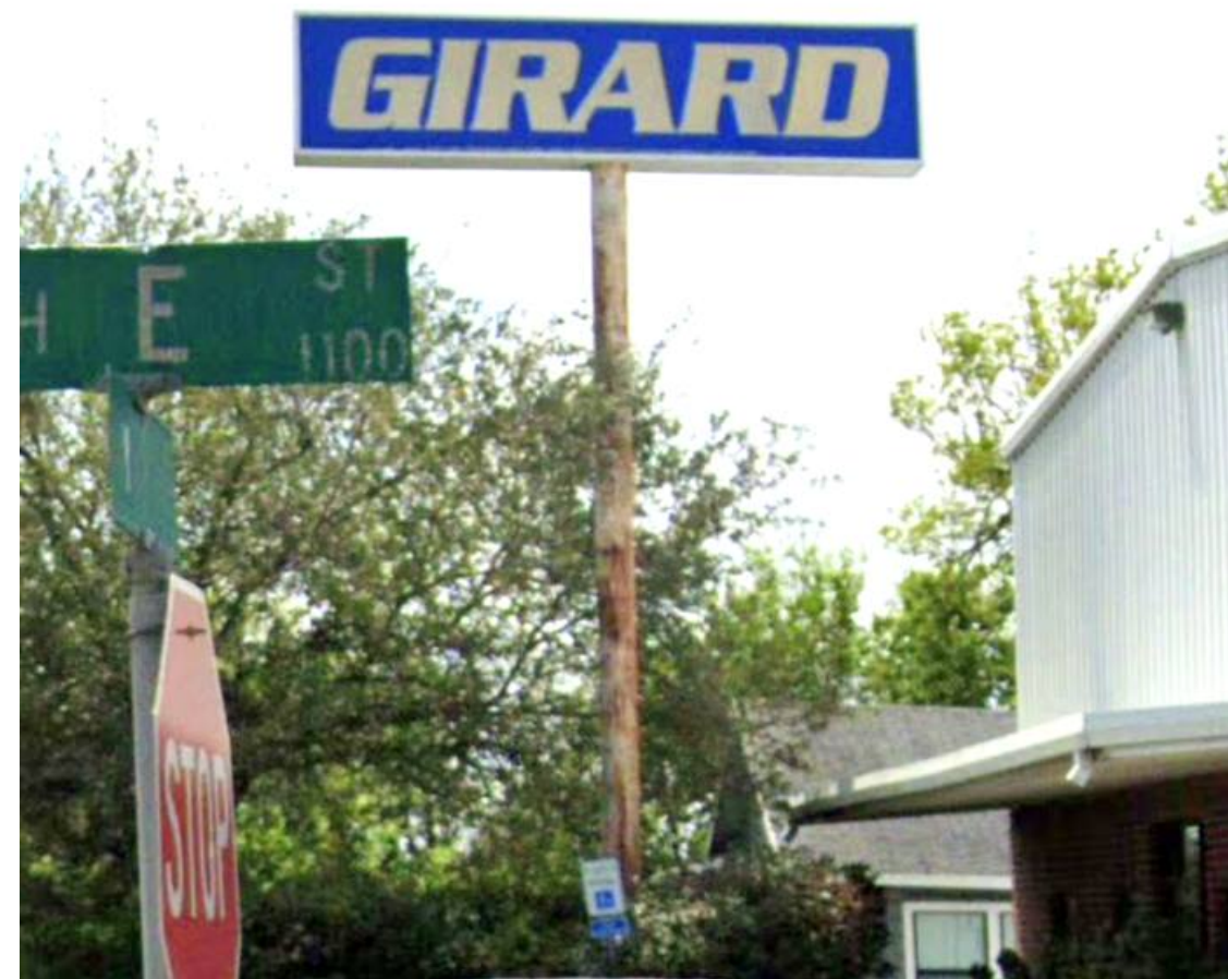
EXISTING ELEVATION SCALE: 1/8" = 1'-0"