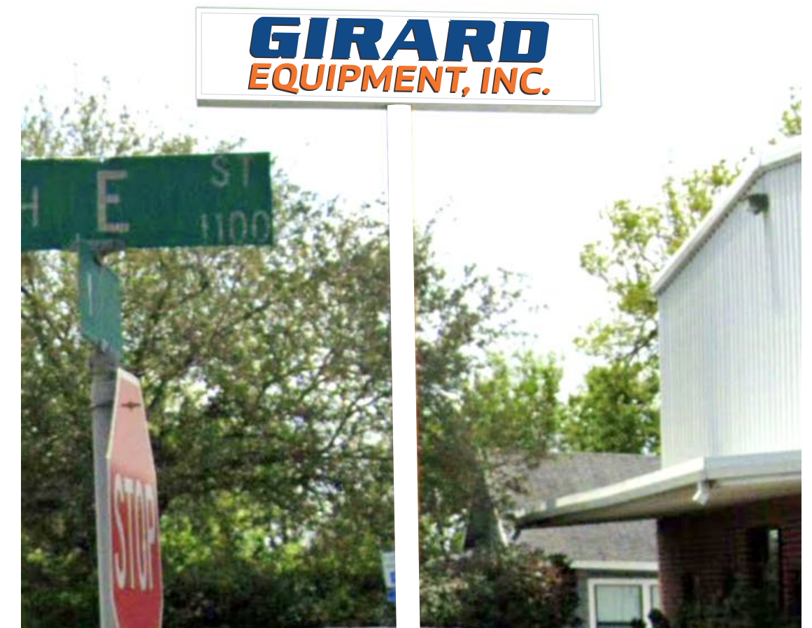
UPDATED ELEVATION SCALE: 1/8" = 1'-0"