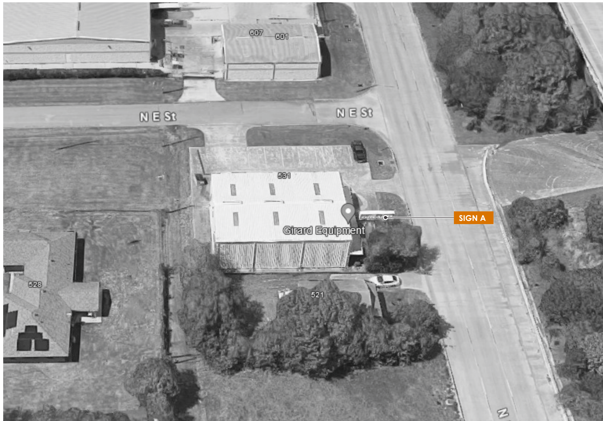
SIGN LOCATIONS SCALE: NTS