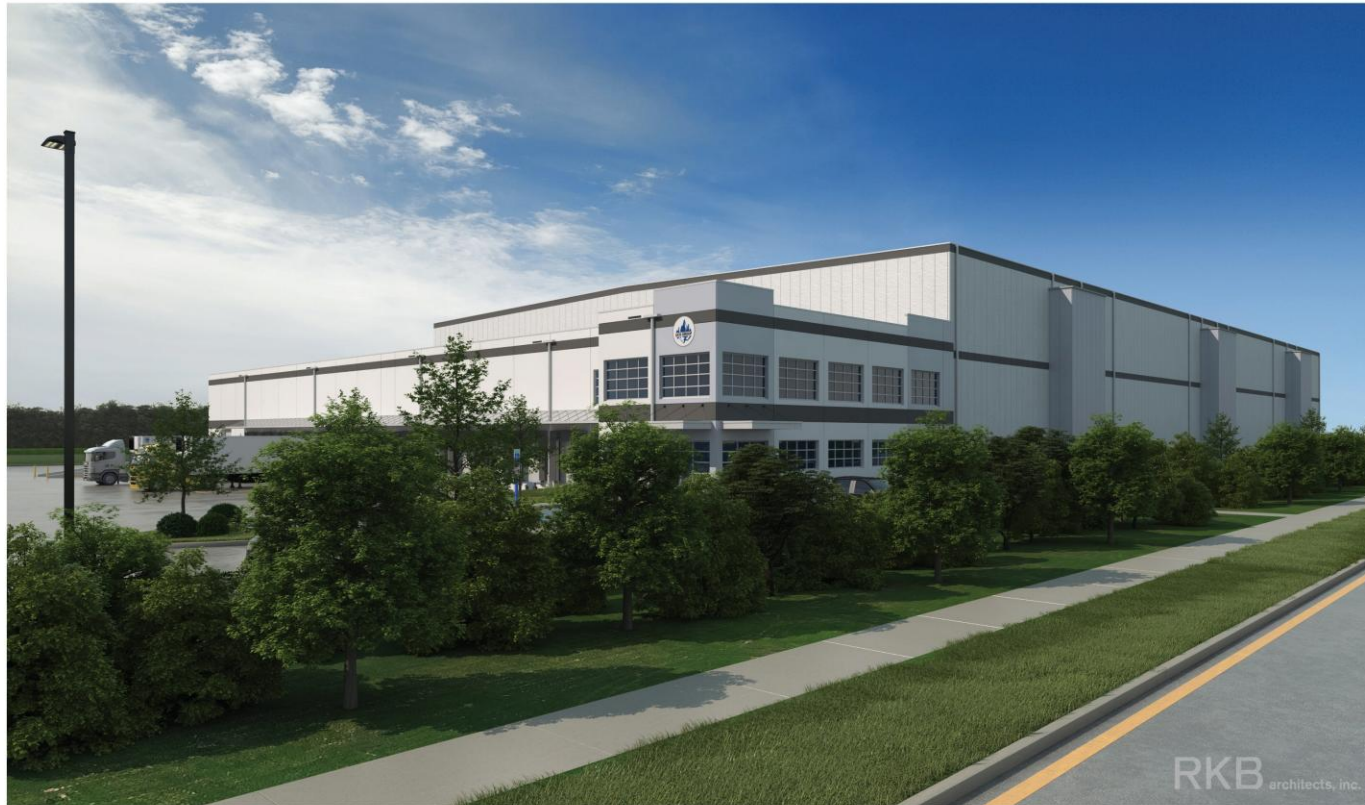
View from S Highway 146 - Looking North