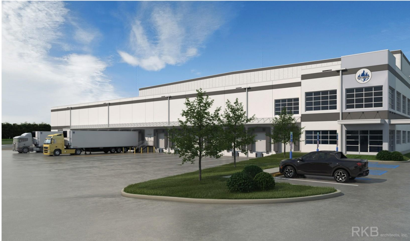
View from Entrance